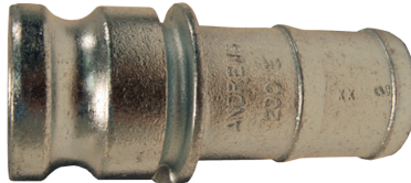
plated malleable iron