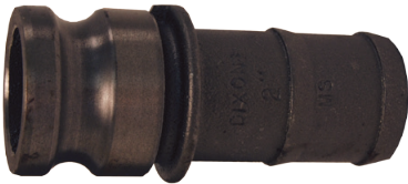
unplated malleable iron