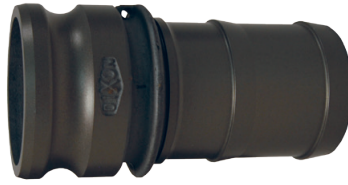
aluminum hard coat